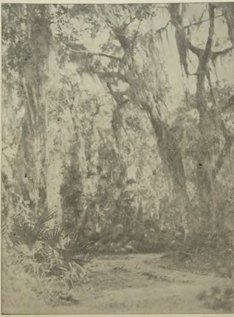
One of the characteristic drives thru a bit of natural Florida growth in Winter Park

You all did see, that on the Lupercal, I tried to put a crown upon his brow, and he, blushing and stammering like a frightened schoolboy, said he preferred to be "just one of the boys." If Brutus calls that ambition, Brutus should look up the word in the dictionary. I am not here to make a liar of